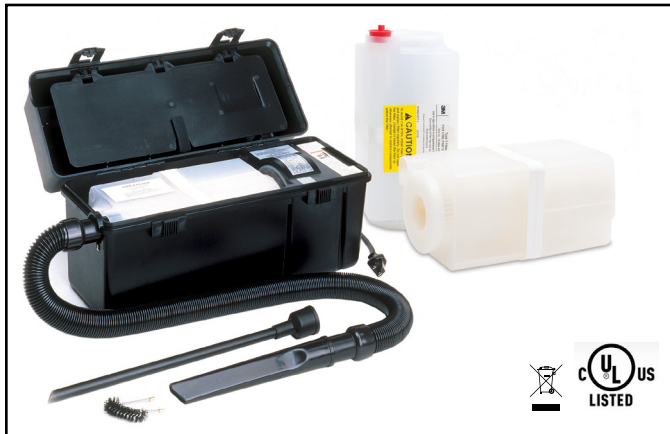
Figure 1. 497AJK HEPA Vacuum.