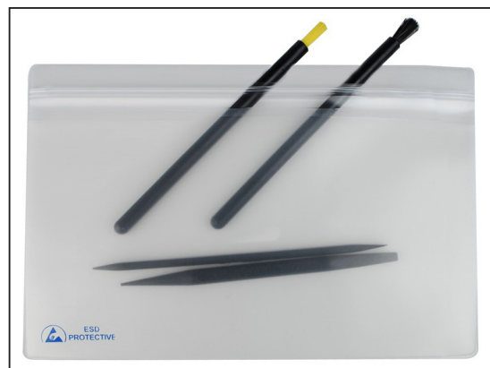
34458 with brush tools and probes (not included)

"It should be understood that any object, item, material or person could be a source of static electricity in the work environment. Removal of unnecessary nonconductors, replacing nonconductive materials with dissipative or conductive materials and grounding all conductors are the principle methods of controlling static electricity in the workplace, regardless of the activity." [ESD Handbook ESD TR20.20-2008 section 2.4 Sources of Static Electricity]