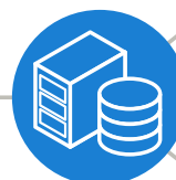
Asset Management Platform