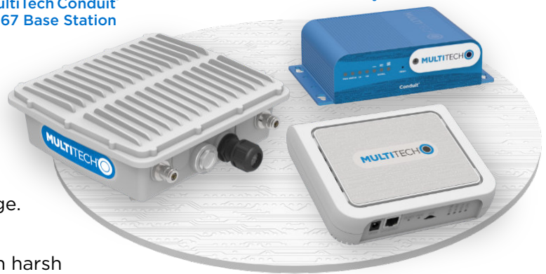
MultiTech Conduit® AP Access Point