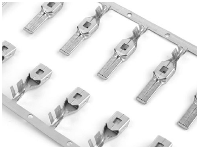
APEX ® 6.35 Female & Male Terminals