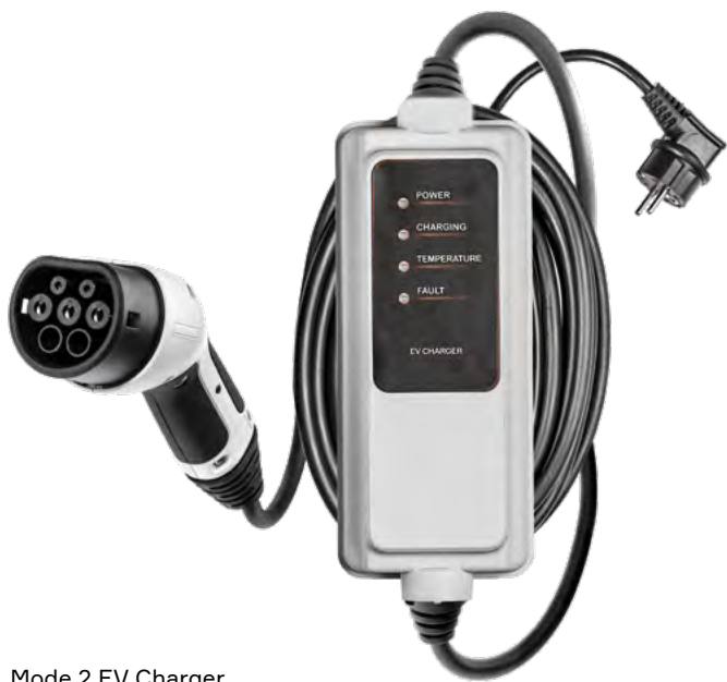
Mode 2 EV Charger