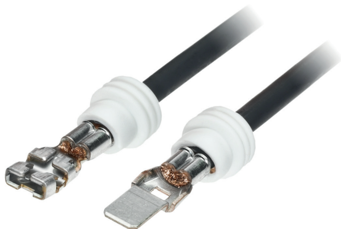
APEX ® 9.5 Female & Male Terminals