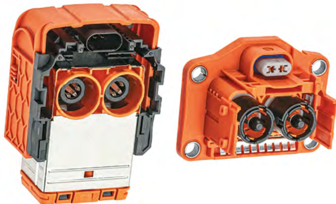
ShieldPack™ HV RCS890 SB RV 2W 90°