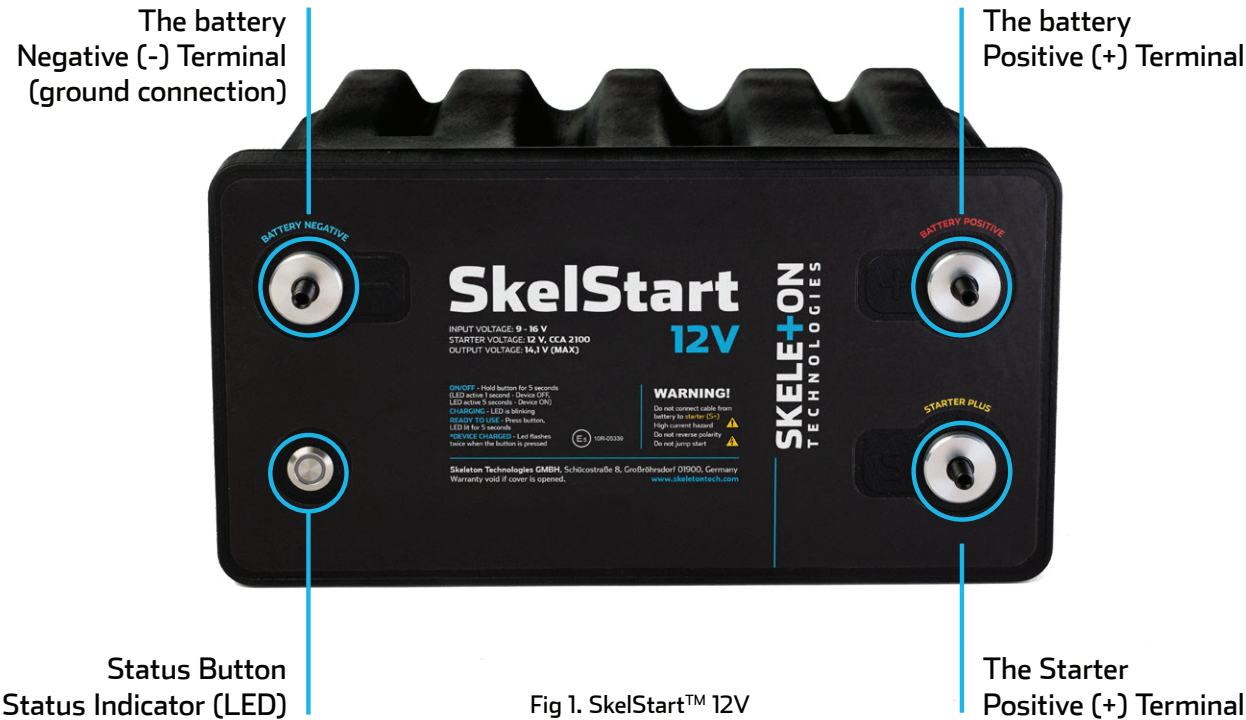
Fig 1. SkelStart™ 12V

Do not connect cables from the battery to the starter (S+) terminal of the SkelStart.