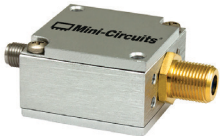
Generic photo used for illustration purposes only CASE STYLE: H557-1