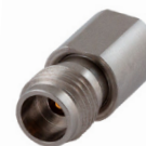
Generic photo used for illustration purposes only