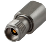
CASE STYLE: LL2592