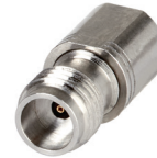
CASE STYLE: LL2592-2