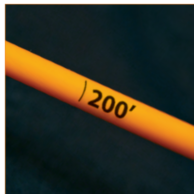
PERMANENT 1' MARKINGS