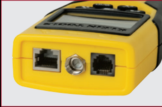
RJ45, F-Connector and RJ11/12 Jacks