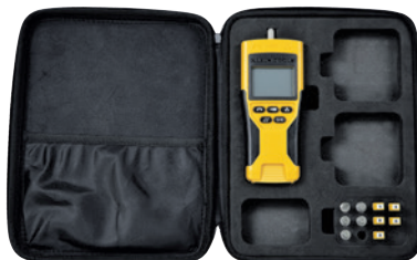
(Products not included)