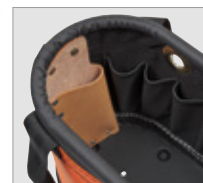
5144HBS Knife Sheath