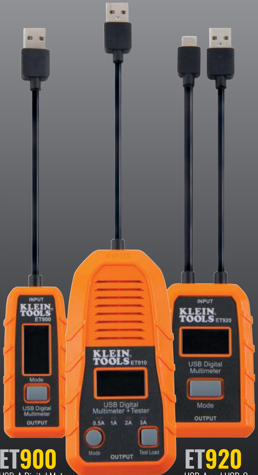
ET900 USB-A Digital Meter