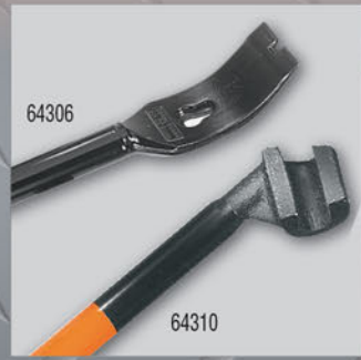
Hickeys & Grizzly Bar