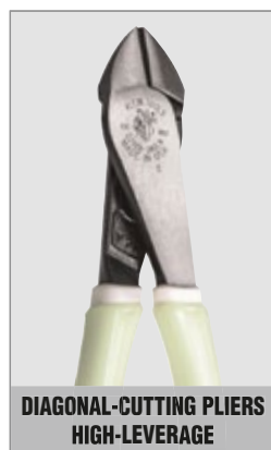
DIAGONAL-CUTTING PLIERS HIGH-LEVERAGE