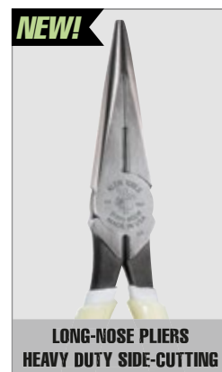
LONG-NOSE PLIERS HEAVY DUTY SIDE-CUTTING