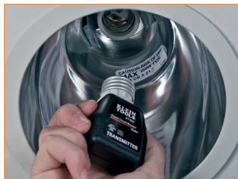
Light Socket Adapter

⚠ WARNING: Read, understand, and follow all instructions, cautions and warnings attached to and/or packed with all test and measurement devices before each use.