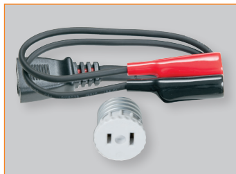
Kit (Adapter and Clips)