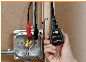
Alligator Clip Adapter for Bare Wires