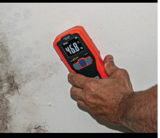
Easy to detect moisture - measure any dry area, then compare test area to confirm moisture content.