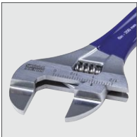
40% Slimmer Jaw