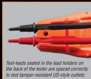
Test-leads seated in the lead holders on the back of the tester are spaced correctly to test tamper-resistant US-style outlets.