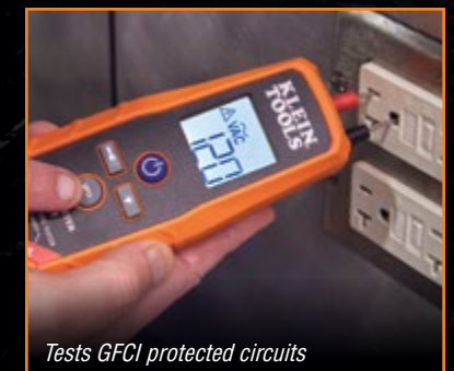
Tests GFCI protected circuits