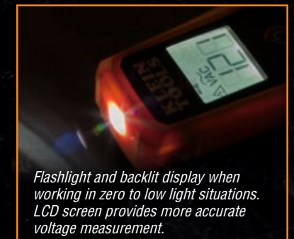
Flashlight and backlit display when working in zero to low light situations. LCD screen provides more accurate voltage measurement.