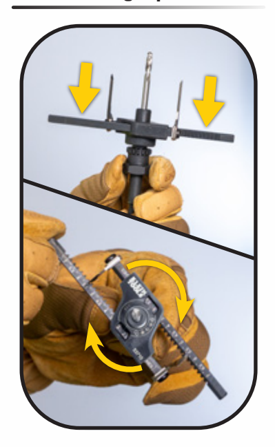
For Professionals SINCE 1857™