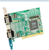
UC-257: uPCI 2xRS232