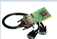
UC-253 LP uPCI 2xRS232