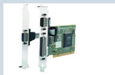
UC-475: uPCI 1xRS232 + 1xLPT Printer Port