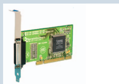
UC-146: uPCI 1xLPT Printer Port