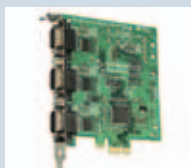
PX-431: PCIe 3xRS232 1MBaud