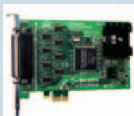
PX-275: PCIe 8xRS232 DB25 1MBaud