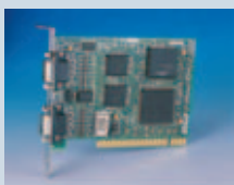
CC-525: PCI 2xRS422/485 18MBaud