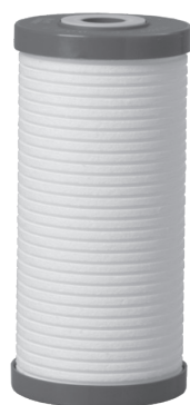
AP810 / AP811