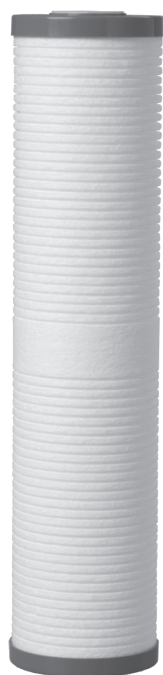
AP810-2 / AP811-2