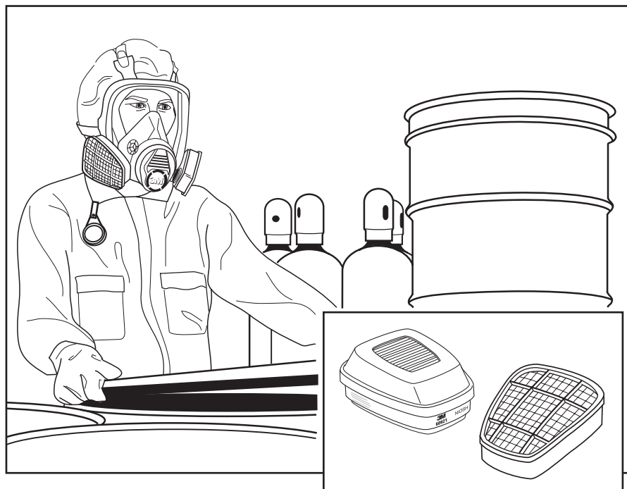
3M™ Multi Gas/Vapor Cartridges shown with 3M™ Full Facepiece 6000 Series and 3M™ Organic Vapor Monitor 3510.