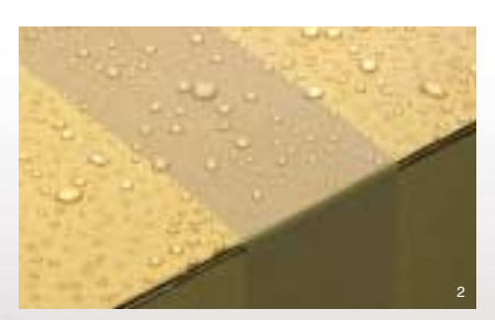
Scotch® Box Sealing Film Tapes resist moisture encountered in storage and shipping through the