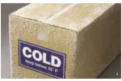
Scotch® Box Sealing Tapes are an outstanding choice for applications where tape is applied