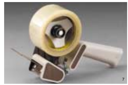
Scotch® Box Sealing Tape Dispenser H-180 Lightweight, pistol-grip dispenser with built-in adjustable brake for tight, consistent seal. Up to 48 mm (2 inch) wide tape. Also available: H-183 for 72 mm wide tape.