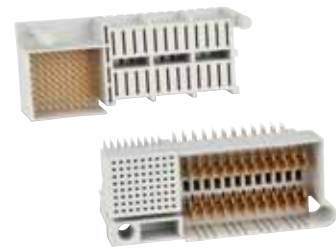
3M™ Power Connectors for MicroTCA™ Applications