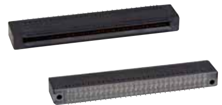
3M™ Signal Connectors for MicroTCA™ Applications