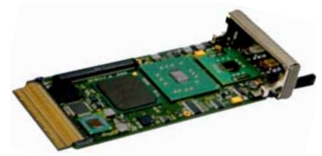
Plug Connector Module