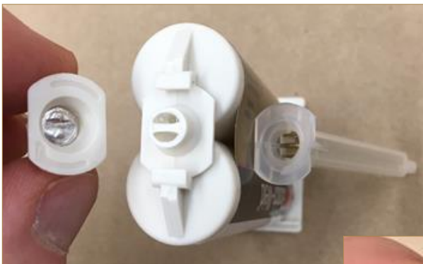
CURRENT CARTRIDGE CAP

The new cap is keyed and cannot be installed backwards, so partially consumed cartridges can be saved and used later.