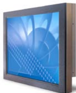
With optional Slimline Bezel (Part Number: 2709122)