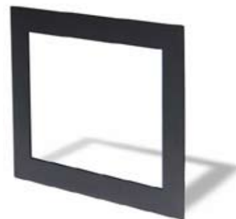
Optional Industrial Flange Bezel (Part Number: 5021104)