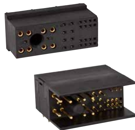
3M™ Power Connectors for ATCA® Applications

Communication equipment: switches, routers, cross-connects