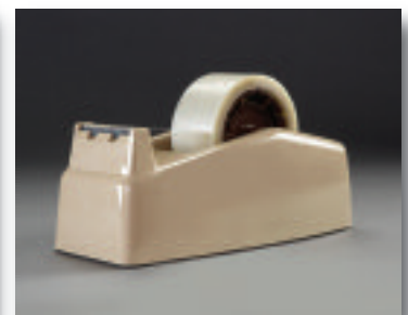
Scotch® Heavy-Duty Tabletop Dispenser C22 for pull and tear convenience.