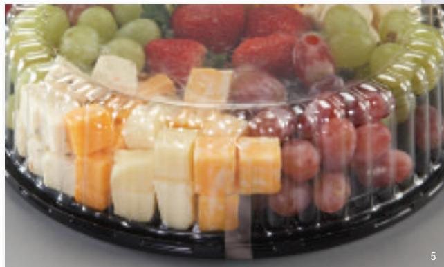
Hold plastic party tray lid with Scotch® Transparent Film Tape 605