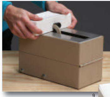
Scotch® Manual Dispenser S63 applies a neat, consistently sized L-clip of tape in a single pass of a box.

Bundle a wider range of fabrics with clean removal Scotch® Transparent Film Tape 640.