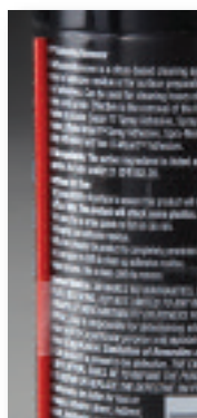
Attach applicator tube to aerosol can with Scotch® Transparent Film Tape 600.