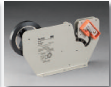
Scotch® Bag Sealer P400 applies tape in an adhesive-to-adhesive flag seal, includes bag trimmer.