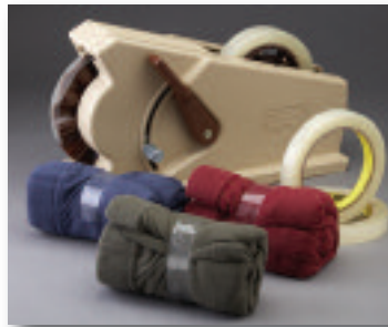
Scotch® Definite Length Dispenser M96 dispenses pre-set lengths of .75" to 5" per stroke.