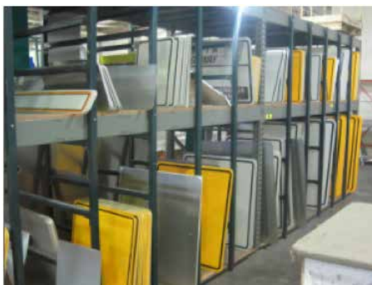
Figure 2: Store signs on edge.

Screen printed images must be completely dry before packaging, storage and shipment.