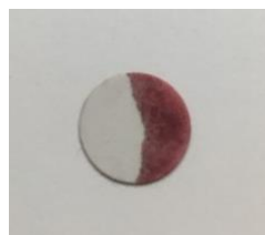
t = 60 sec

1 drop of water place at edge of ½" diameter circle @ t = 0 sec