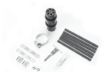
3M™ SLiC™ 6-port Grommets