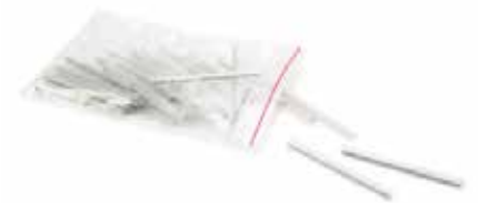
3M™ Fiber Optic Splice Sleeve 2170