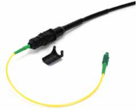
3M™ External Cable Assembly Module (ECAM) FD Factory-Terminated Fiber Drop