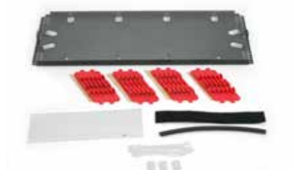
3M™ Fiber Optic Splice Tray 2527