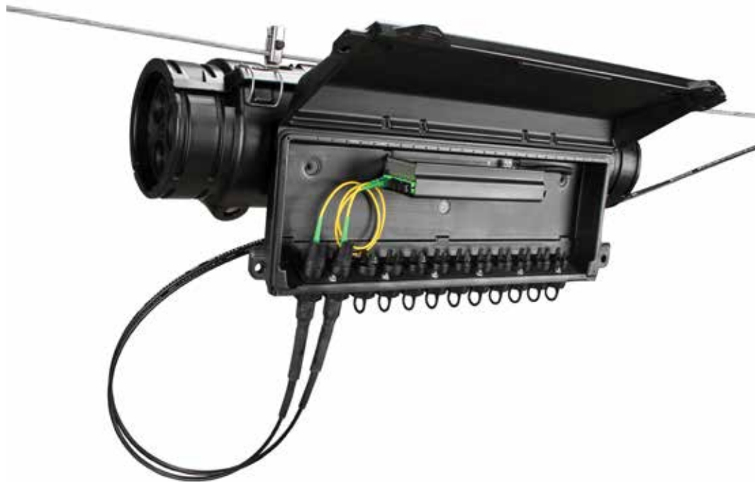
3M™ SLiC™ Fiber Aerial Terminal Closure 530 with Internal Drop Termination for Factory-Terminated ECAM FD Drop Cable

This craft separation feature allows the installer (I&R craftsman) to terminate and maintain the drop without entering the splice chamber. Also, the terminal box is equipped with tabs which allow the terminal box to be locked to provide greater network security.