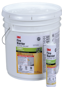
Compression/extension capabilities for dynamic joint applications

3M™ Fire Barrier Silicone Sealant 2000+ firestops dynamic construction joints, blank openings and penetrations passing through fire-rated floor, floor/ceiling or wall assemblies and other fire-rated interior building construction. The sealant remains elastomeric, bonds to most common construction materials and exhibits excellent weatherability during construction. No mixing is required.