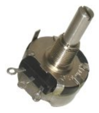
Representative photograph, actual product appearance may vary.

Due to regional agency approval requirements, some products may not be available in your area. Please contact your regional Honeywell office regarding your product of choice.