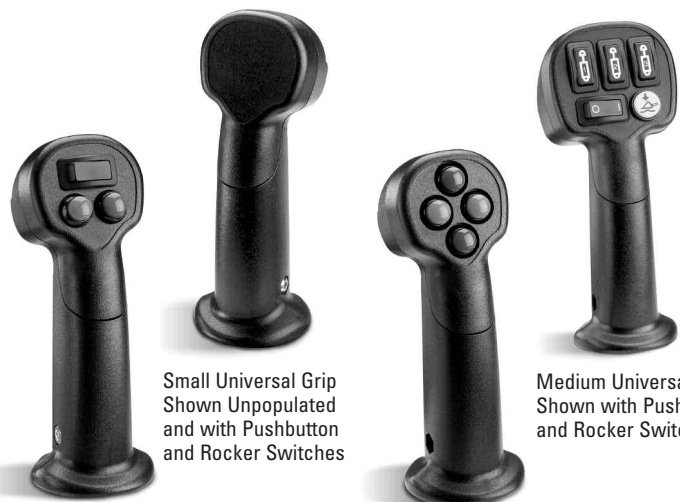
Small Universal Grip Shown Unpopulated and with Pushbutton and Rocker Switches