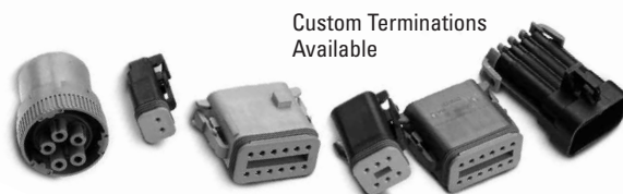
Custom Terminations Available