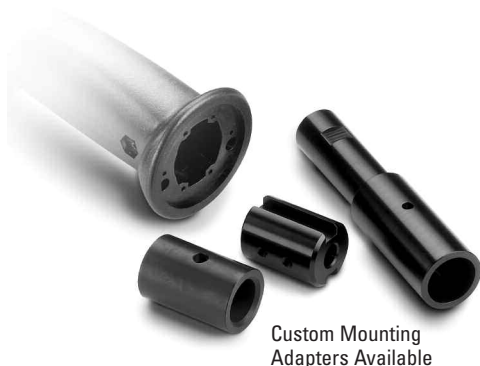
Custom Mounting Adapters Available