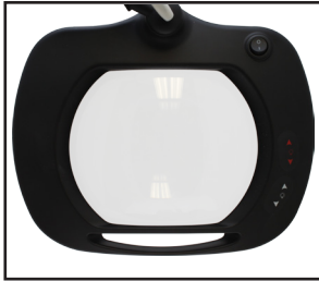
7.5 Inch x 6.2 inch/ 5 Diopter Lens 2.25x Magnification