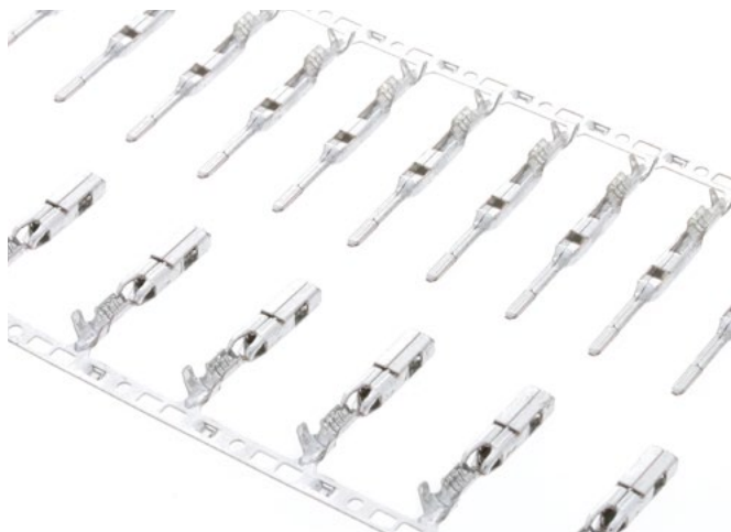
SICMA 1.5 Female & Male Terminals