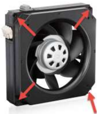
Original Style – Countersunk