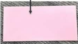
(Before: PU FOAM)