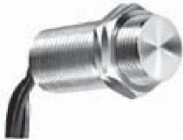
103SR digital sensors