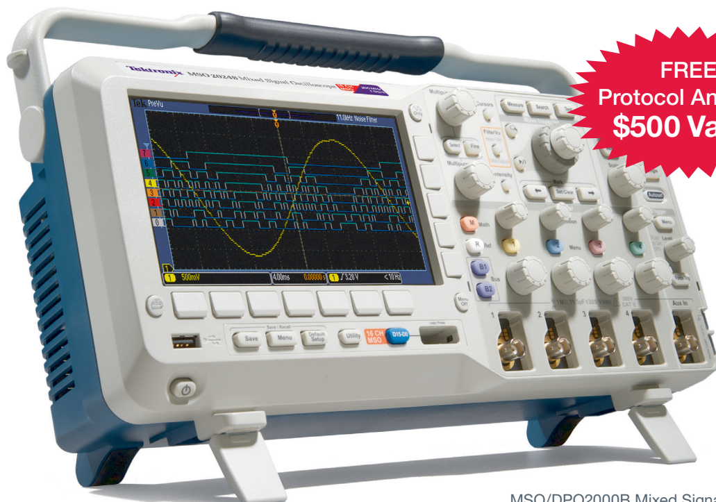
MSO/DPO2000B Mixed Signal Oscilloscope Series*

The most powerful scope you can buy for $1,290.